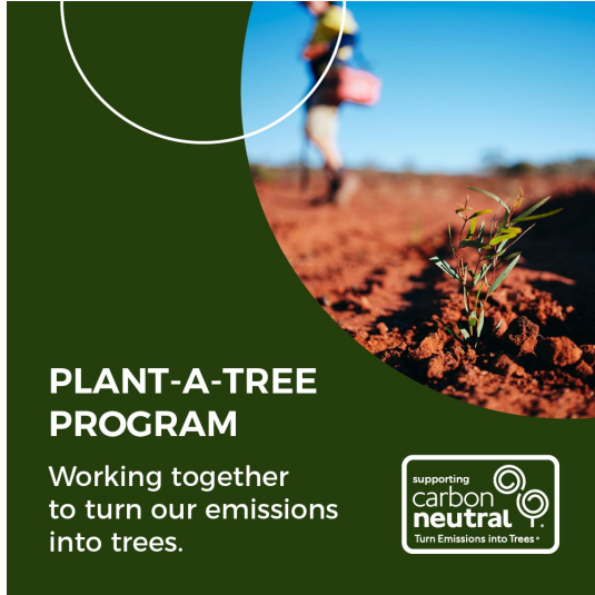
Social media post 04