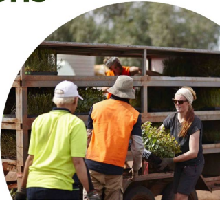
Social media post 10