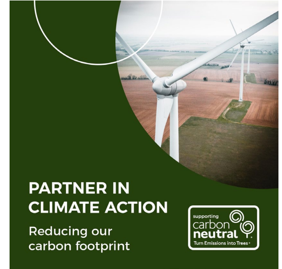
Social media post 03