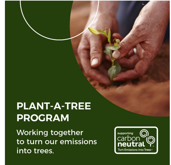
Social media post 09