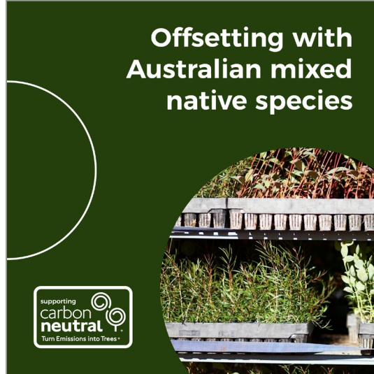
Social media post 08