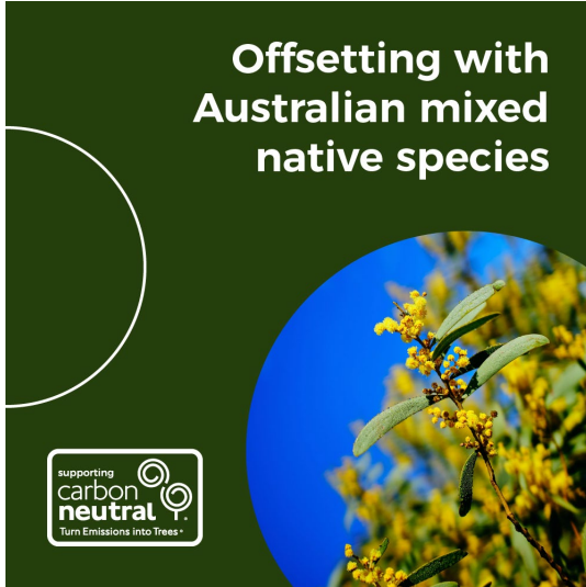
Social media post 01