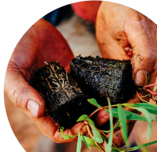
Social media post 11