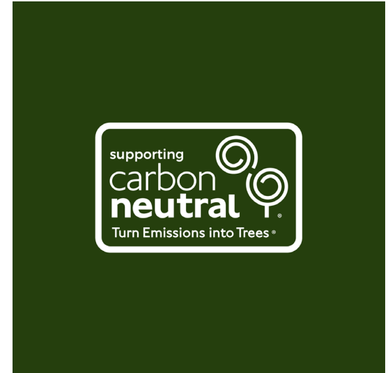
Social media post 06