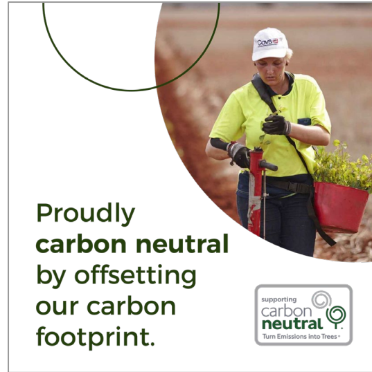
Social media post 02