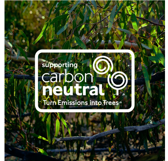
Social media post 12