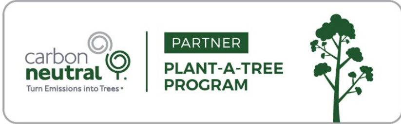
05. Plant-a-Tree Partner banner tree icon