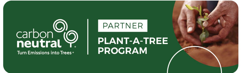
08. Plant-a-Tree Partner banner picture reversed