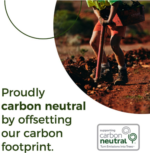
Social media post 07